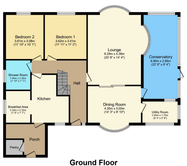
Floor area 135.7 sq.m. (1,461 sq.ft.) approx