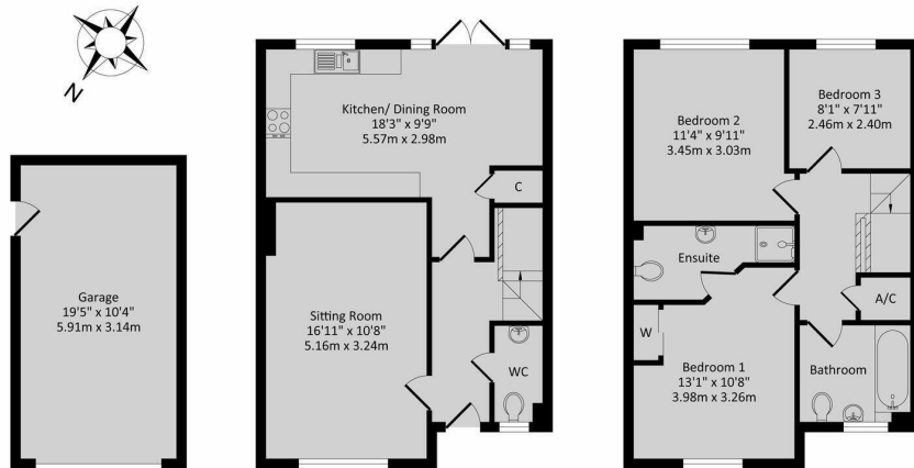
TOTAL APPROX. FLOOR AREA 1152 sq.ft. (107.0 sq.m.) approx.

Whilst every attempt has been made to ensure the accuracy of the floor plan contained here, measurements of doors, windows, rooms and any other items are approximate and no responsibility is taken for any error, omission, or mis-statement. This plan is for illustrative purposes only and should be used as such by any prospective purchaser. The services, systems and appliances shown have not been tested and no guarantee as to their operability or efficiency can be given.