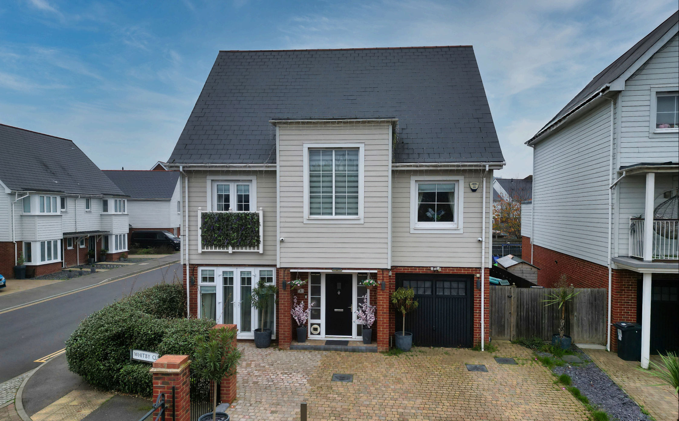
WHITBY CLOSE Holborough Lakes | Kent | ME6 5FJ