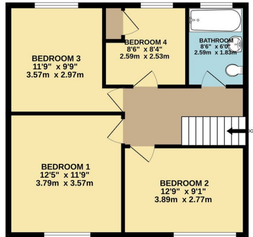
1ST FLOOR 571 sq.ft. (53.0 sq.m.) approx.