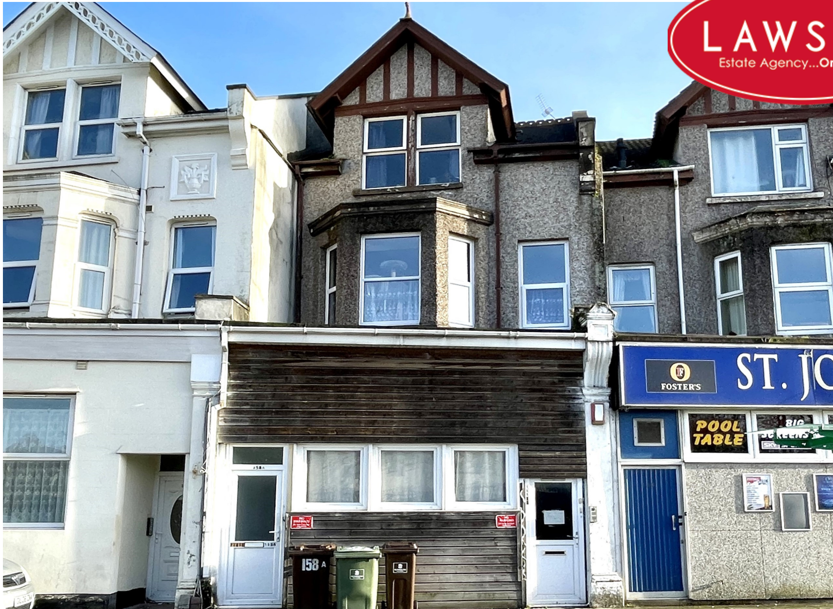
TOP FLOOR FLAT, 158 SALTASH ROAD, KEYHAM, PLYMOUTH, PL2 2BE