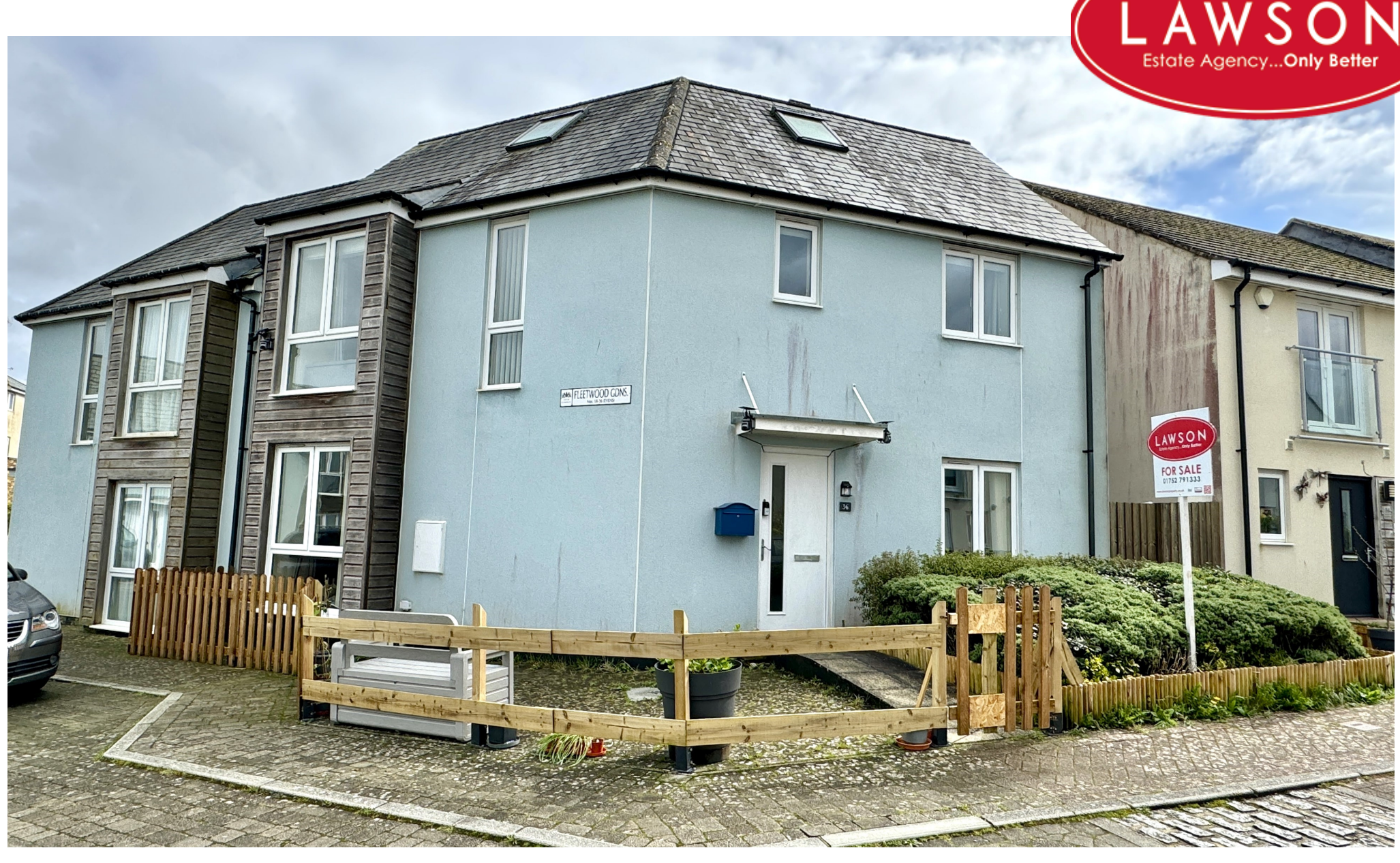
36 FLEETWOOD GARDENS, SOUTHWAY, PLYMOUTH, PL6 6FA