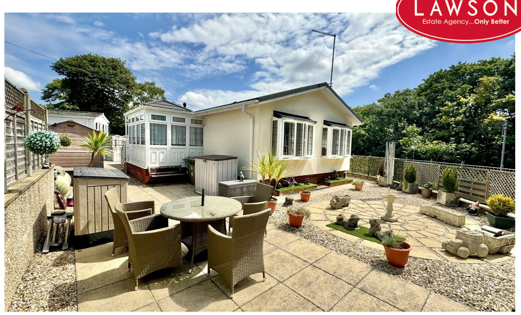
4 SYCAMORE WAY, GLENHOLT PARK, PLYMOUTH, PL6 7NQ