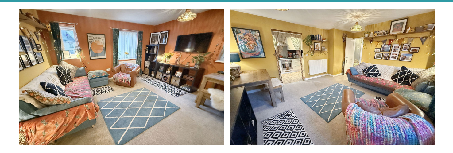
Approx Gross Internal Area 57 sq m / 614 sq ft

victoria.bolt@exp.uk.com victoriabolt.exp.uk.com 07415 758 109