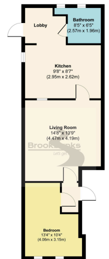
Floor Plan Approx. Gross Internal Floor Area 555 sq. ft / 51.56 sq. m Illustration for general information only. Measurements are approximate. Not to scale. Produced by Elements Property