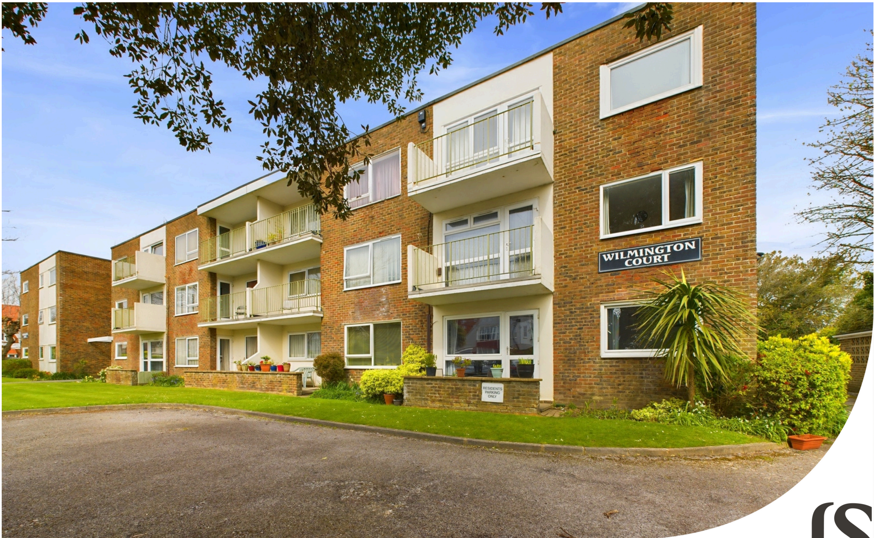
Wilmington Court | Bath Road | West Sussex | BN11 3QN Offers Over £240,000