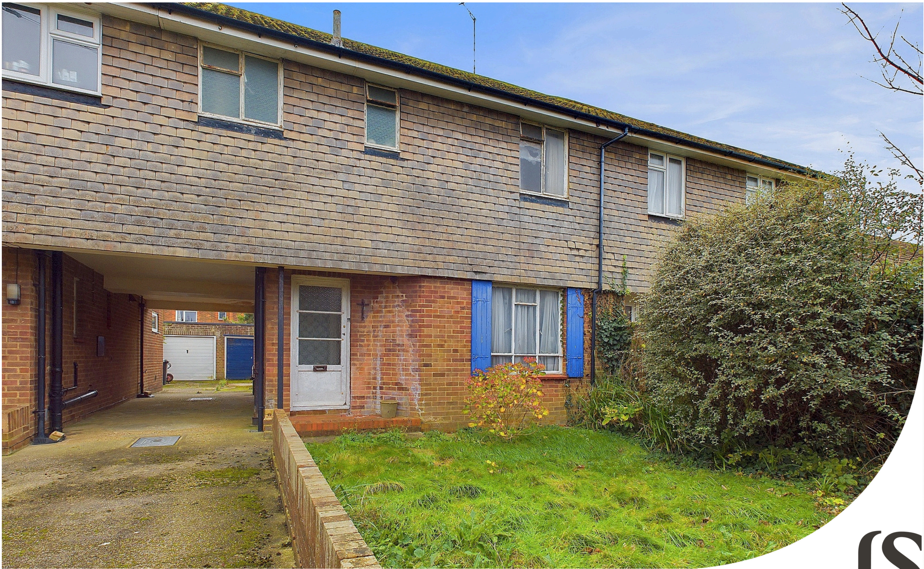
11a Aglaia Road, Worthing, BN11 5SN Guide Price £360,000