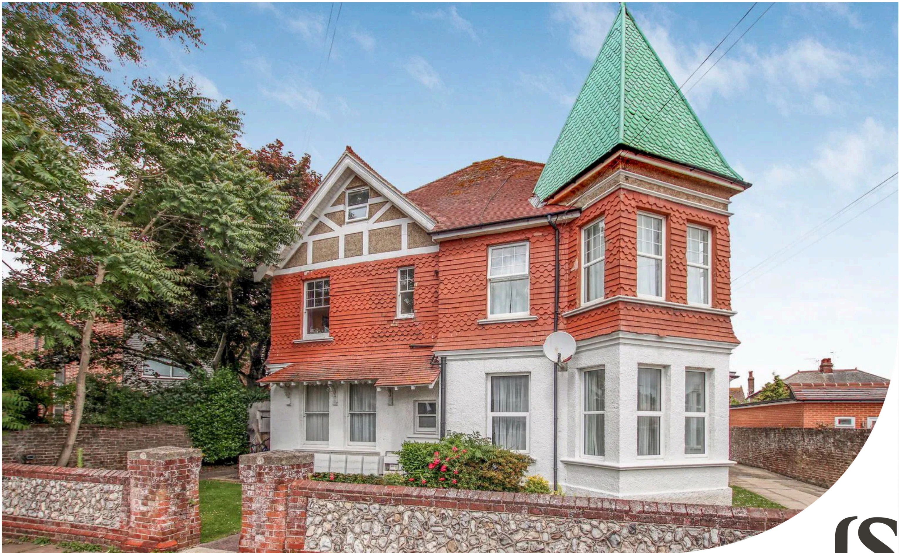
Tower House, 5, Reigate Road, Worthing, BN11 5NF Asking Price of £250,000