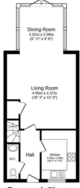
Ground Floor Floor area 46.9 m² (505 sq.ft.)