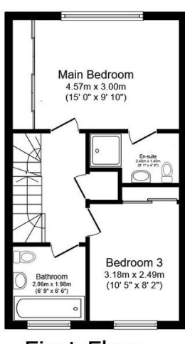
First Floor Floor area 37.9 m² (407 sq.ft.)