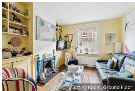
Sitting Room, Ground Floor