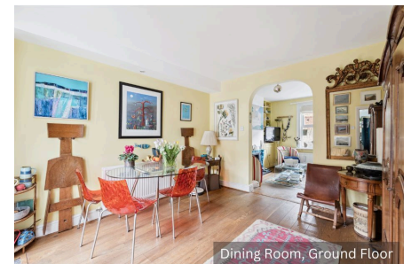
Dining Room, Ground Floor

Larger than it looks! 1174sqft floor area, three bedroom terraced cottage in Jericho, Oxford within easy walking distance of just about everywhere you are likely wanting to go to in Oxford.