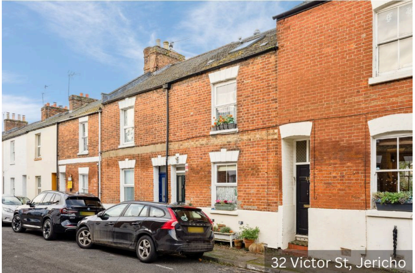
32 Victor St, Jericho