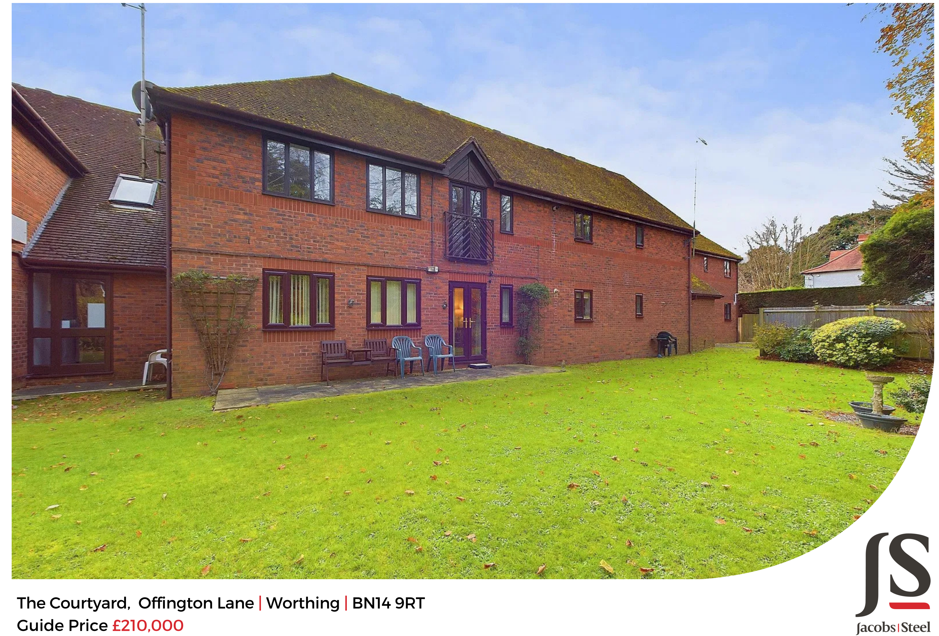
Guide Price £210,000