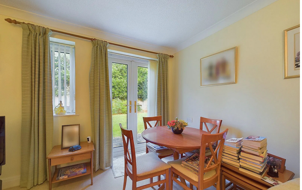
Property details: The Courtyard, Offington Lane | Worthing