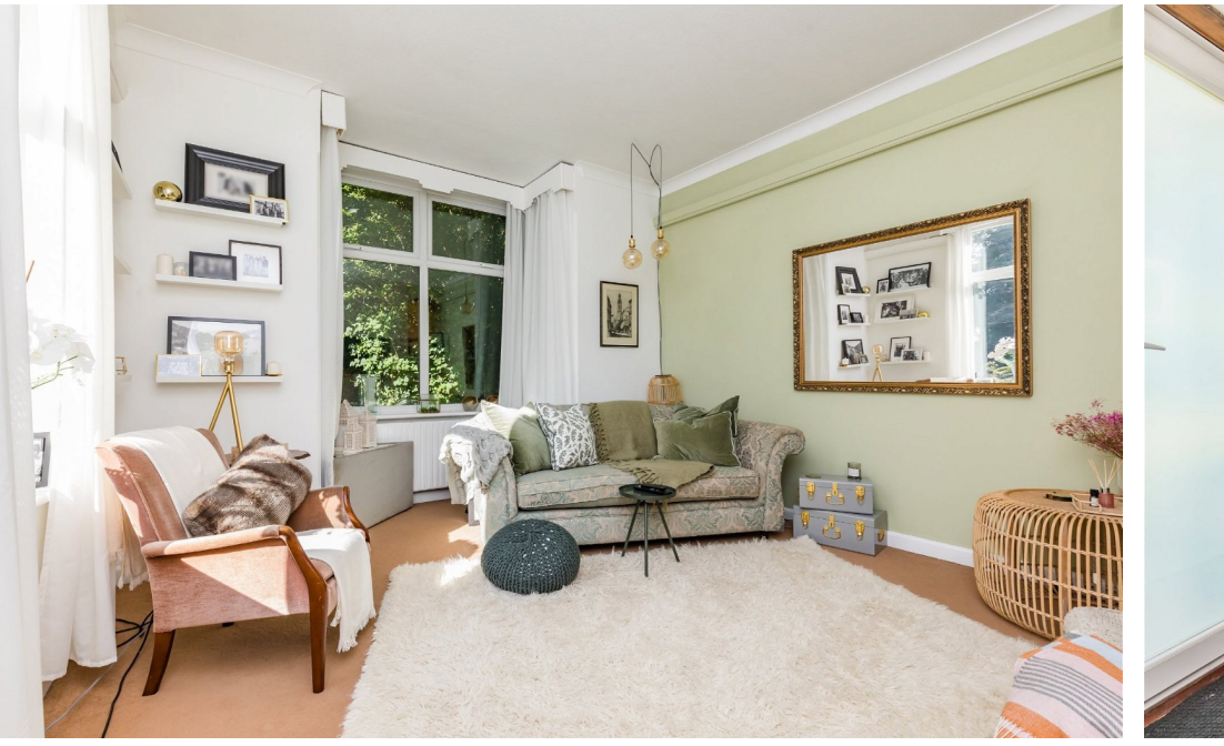
Property details: Warren Road | Offington | BN14 9QX

We would love to present this spacious detached house on a generous plot backing on and with direct side access to Worthing Golf Course. The property boasts five bedrooms, modern fitted kitchen/dining room, living room, dining room, study, ground floor cloakroom/wc, an annexe with ensuite, extensive parking and large gardens. The plot has potential for development, subject to necessary planning consent. Must be viewed to appreciate this exclusive location.