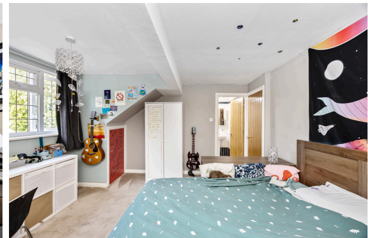
Property details: Longlands Glade | Worthing | BN14 9NR