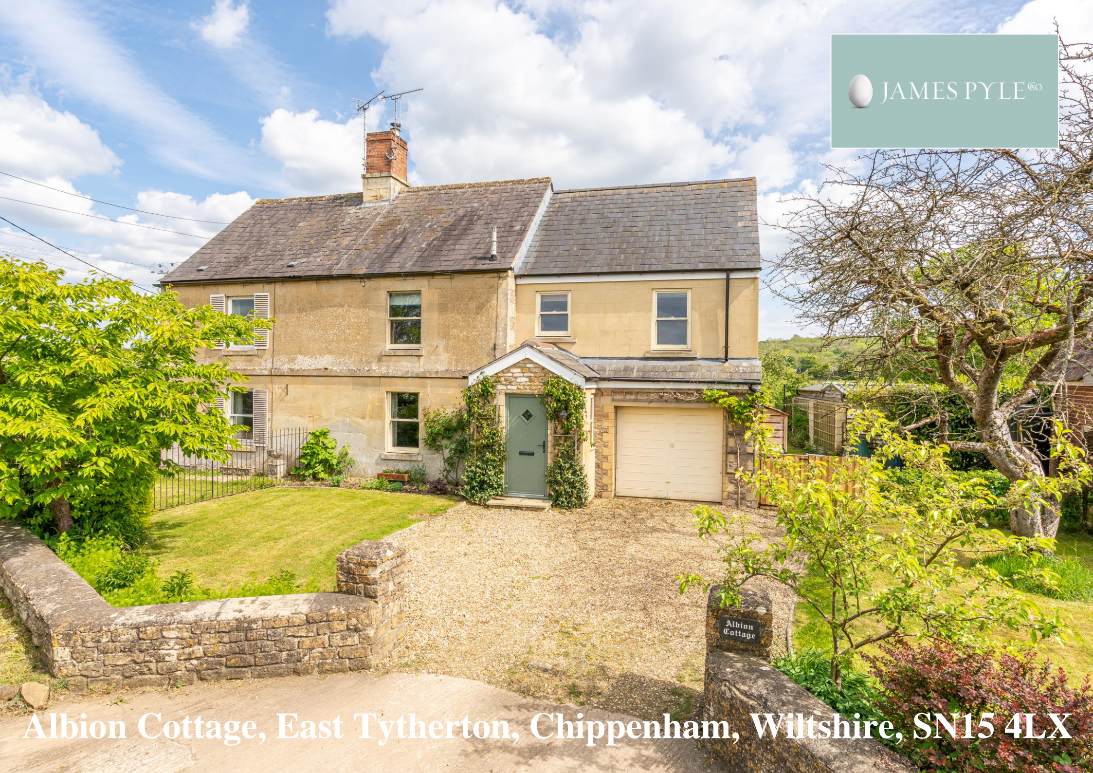
Albion Cottage, East Tytherton, Chippenham, Wiltshire, SN15 4LX