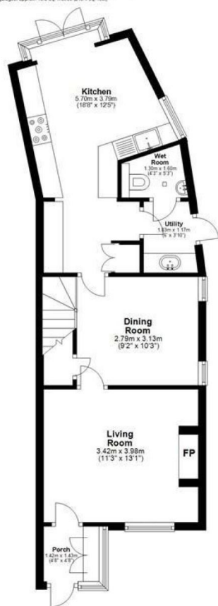
Main area: Approx. 90.1 sq. metres (969.7 sq. feet) Plus garages: approx. 19.5 sq. metres (210.4 sq. feet)