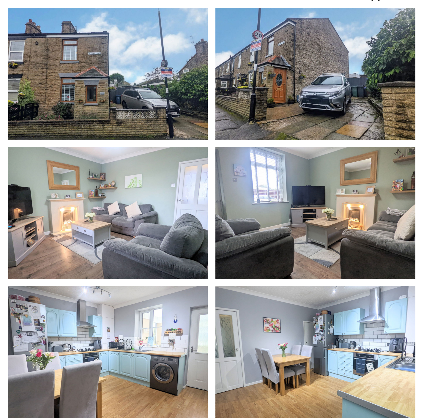
2 1 22