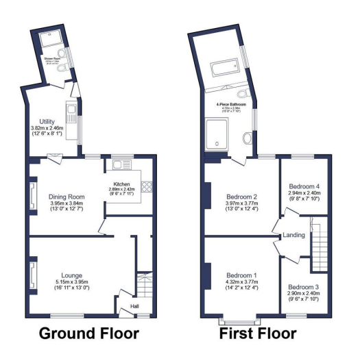
Total floor area 130.8 m² (1,408 sq.ft.) approx

This floor plan is for illustrative purposes only. It is not drawn to scale. Any measurements, floor areas (including any total floor area), openings and orientation are approximate. No details are guaranteed, they cannot be relied upon for any purpose and they do not form part of any agreement. No liability is taken for any error, omission or misstatement. A party must rely upon its own inspection(s). Powered by www.focalagant.com