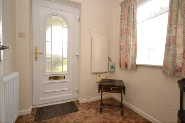
Book a Viewing

01243 861344 Sales@ClarkesEstates.co.uk 27 Sudley Road, Bognor Regis, PO21 1EW http://www.clarkesestates.co.uk