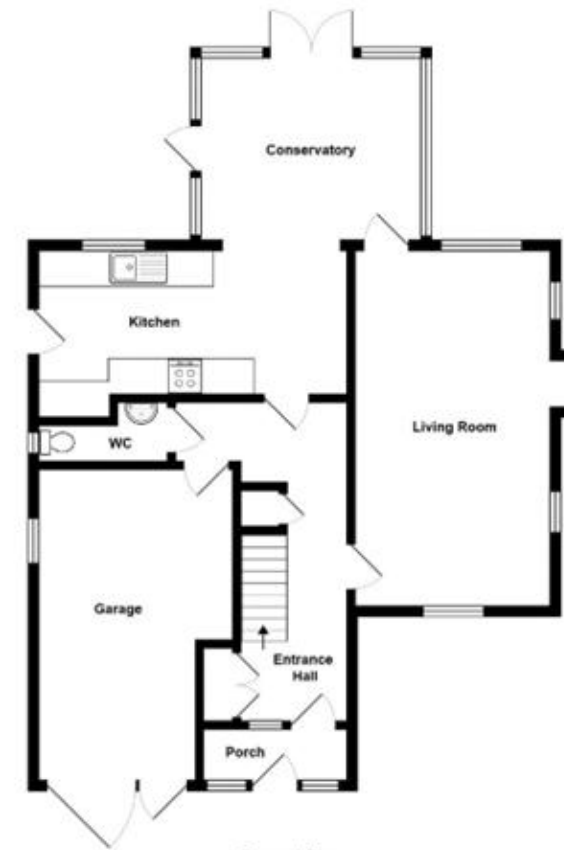
Ground Floor Total Area: 82.5 m 2 ... 888 ft 2 All measurements are approximate and for display purposes only Floorplans created by Clarke's Estates 01243 861344