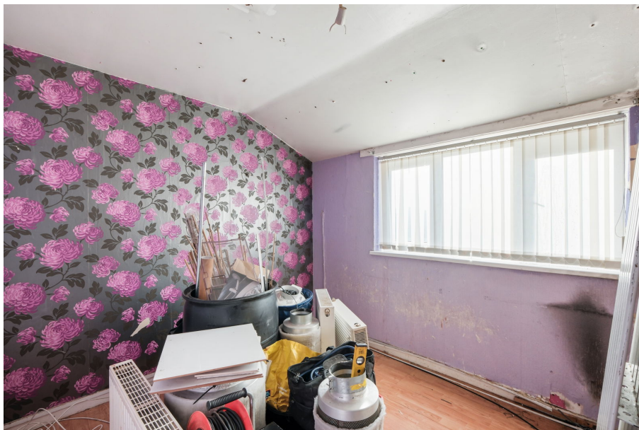
Jubilee Road, Rednal, Birmingham Ground Floor