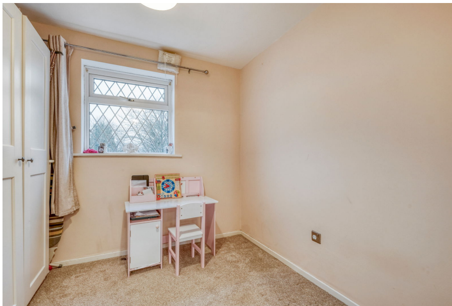
Kempsey Covert, Kings Norton, Birmingham Ground Floor