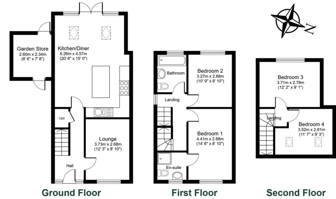
NOT TO SCALE For layout guidance only Total floor area 110.4 sq.m. (1,189 sq.ft.) Approx (Including Garden Store)

To the outside; A block paved driveway offers off-road parking for multiple vehicles and provides access to a lean-to garage store with lighting and power, an ideal space for bike storage or garden equipment. The front garden is primarily laid to lawn, with flower bed borders housing an assortment of flowering shrubs and bushes. The south / westerly facing rear garden is a particular feature of the property, low maintenance as set largely to lawn with raised stone flower beds housing a range of shrubs, bushes and small trees, perimeter is a combination of garden wall, hedgerow and timber fence. A stone flagged patio area offers a perfect suntrap, ideal for outdoor entertaining, barbecues and alfresco dining during the summer months.