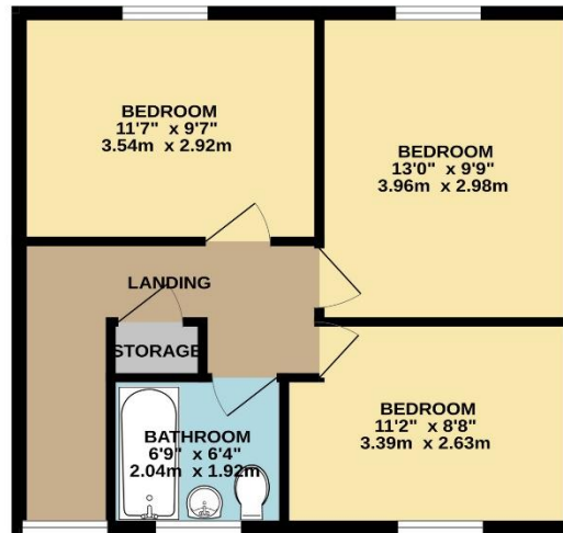
1ST FLOOR 462 sq.ft. (43.0 sq.m.) approx.