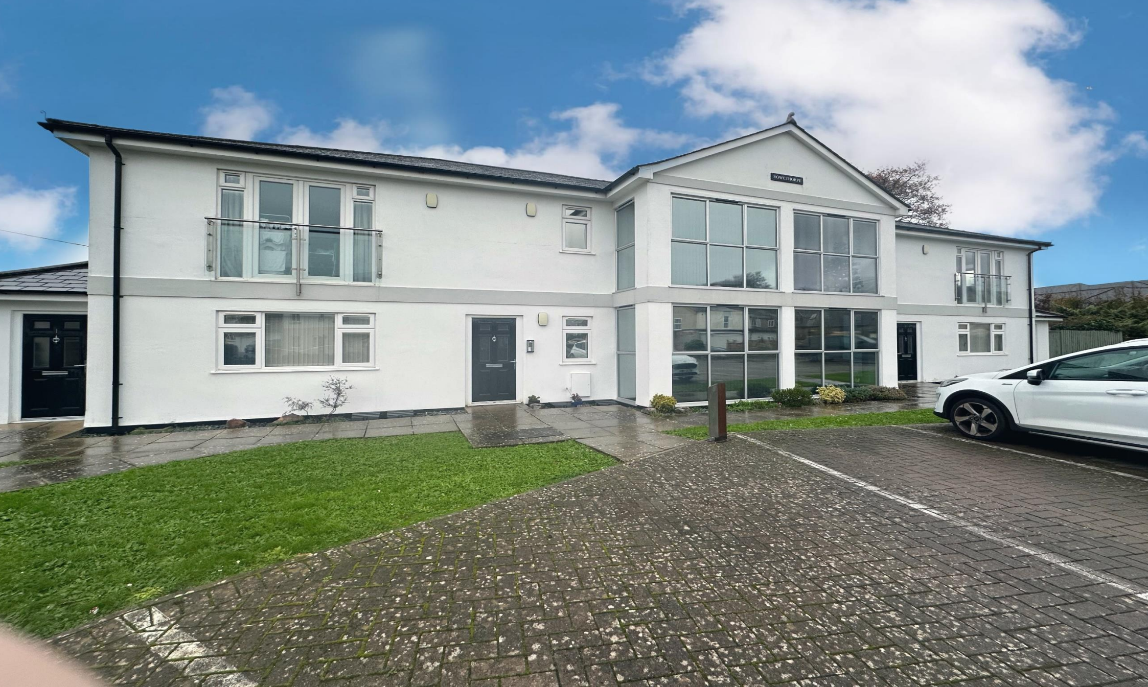
Apartment 2 Rowethorpe, 29 Horn Lane, Plymstock, Plymouth, Devon, PL9 9BR