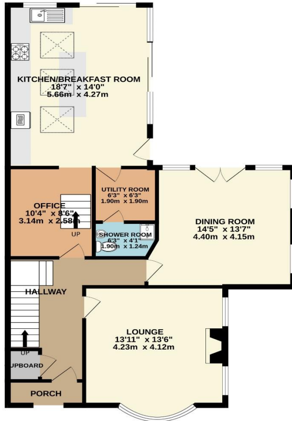
GROUND FLOOR 934 sq.ft. (86.8 sq.m.) approx.