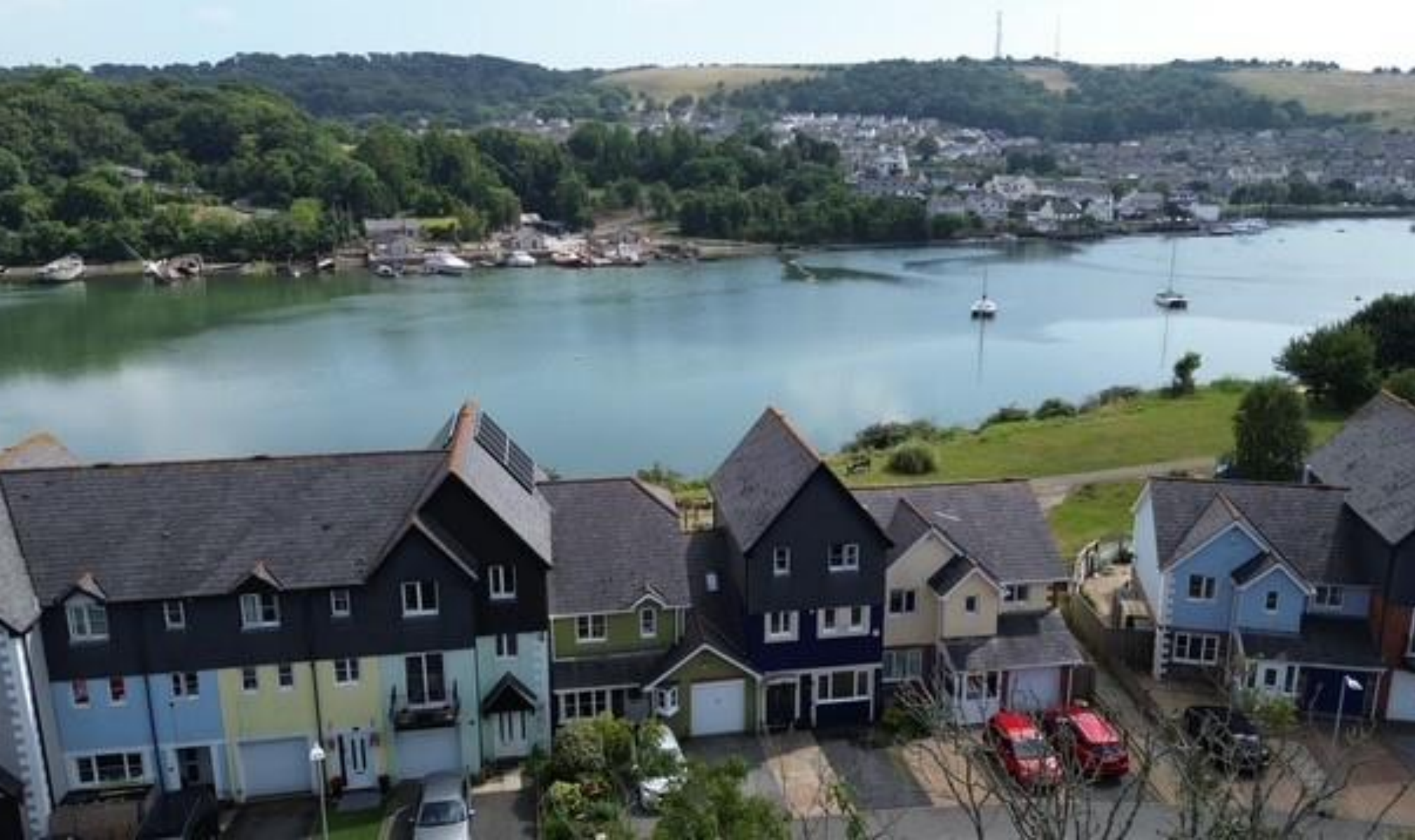
16 The Old Wharf, Oreston, Plymouth, Devon, PL9 7NP