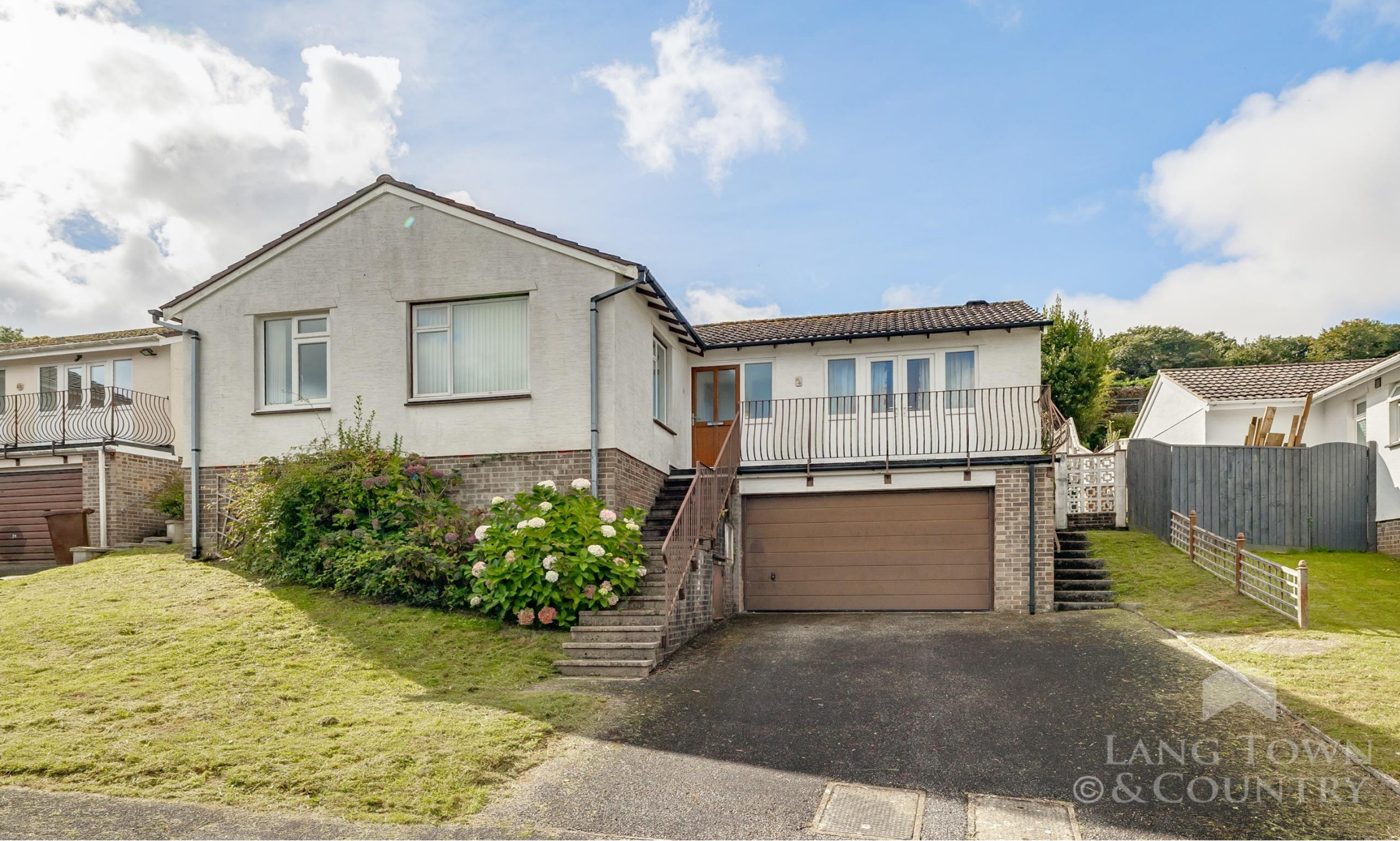
64 Reddicliff Close, Radford Park, Plymouth, Devon, PL9 9QJ