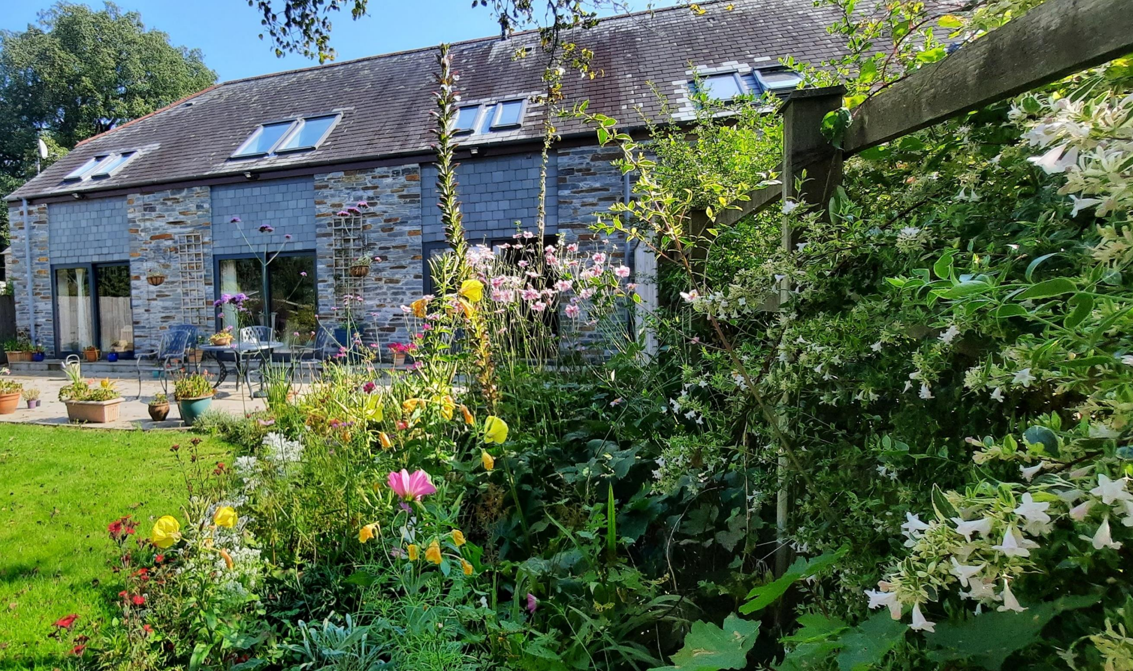
Pear Tree House, 50 Blunts Lane, Derriford, Plymouth, Devon, PL6 8BE