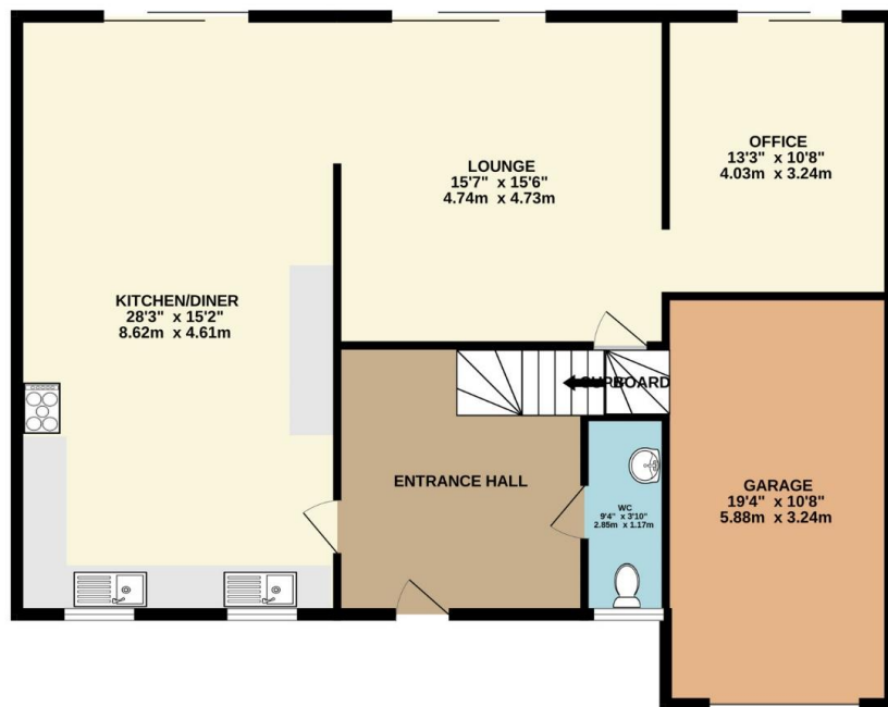
GROUND FLOOR 1213 sq.ft. (112.7 sq.m.) approx.