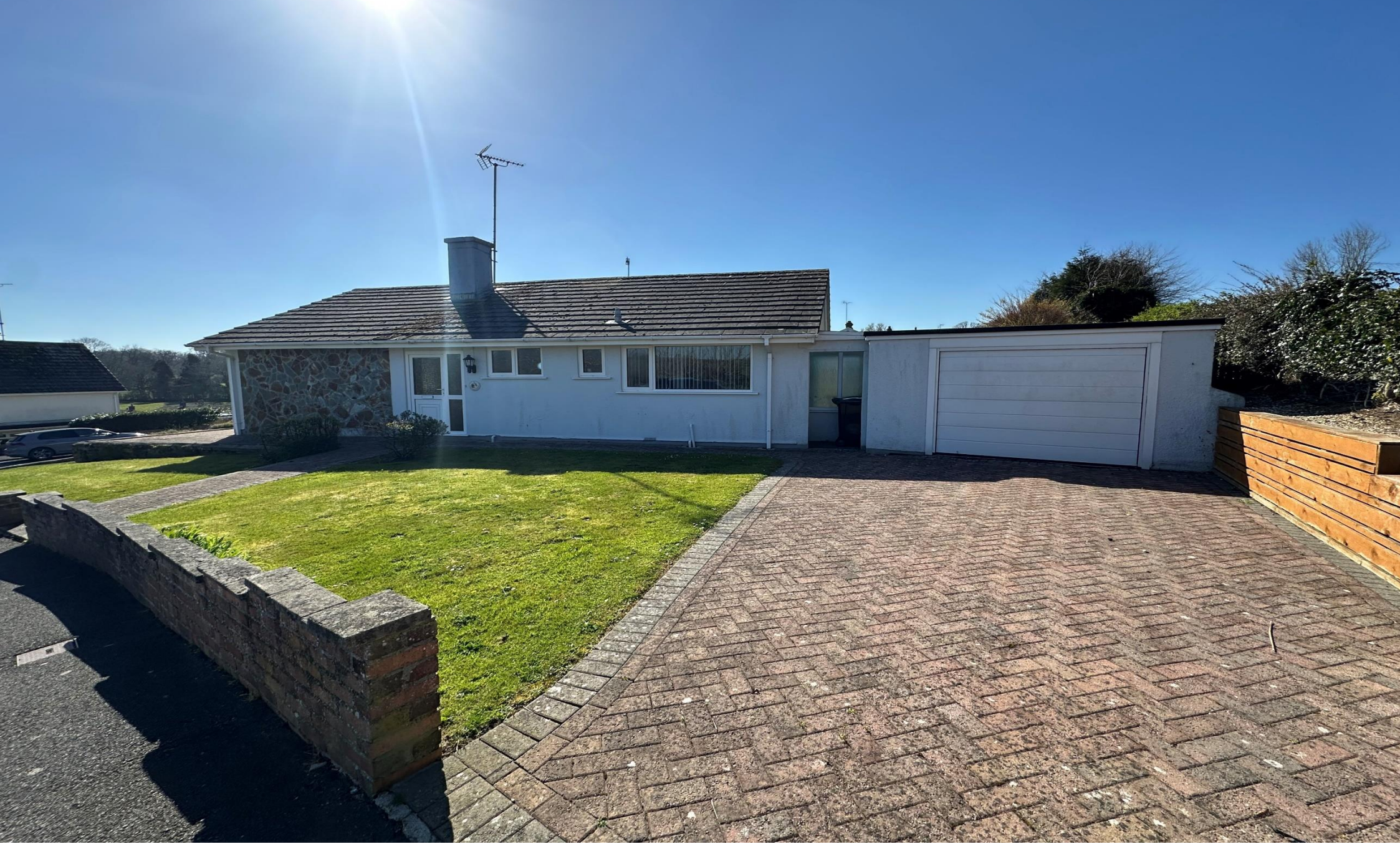
1 The Crescent, Brixton, Plymouth, Devon, PL8 2AP