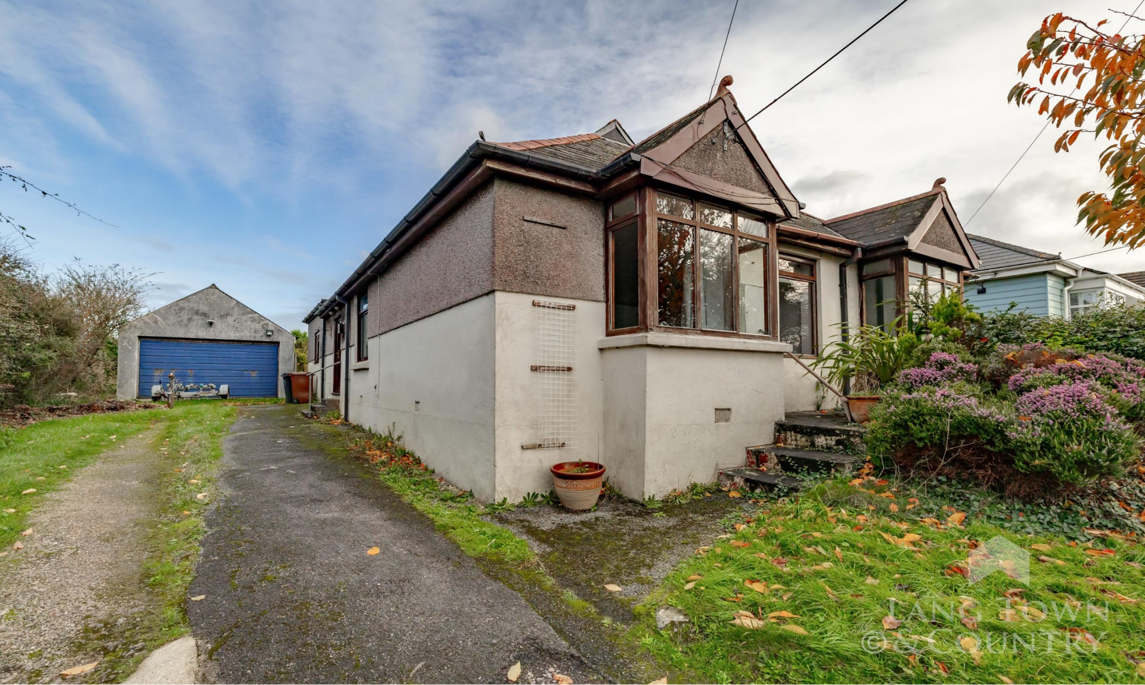
49 Church Road, Wembury, Plymouth, Devon, PL9 0JF