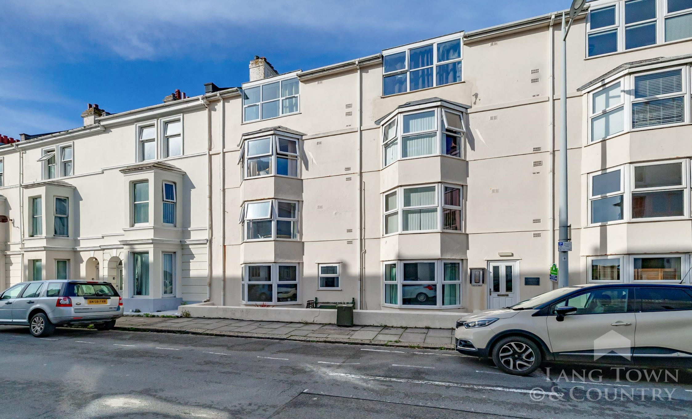
38A Grand Parade, The Hoe, Plymouth, Devon, PL1 3DJ