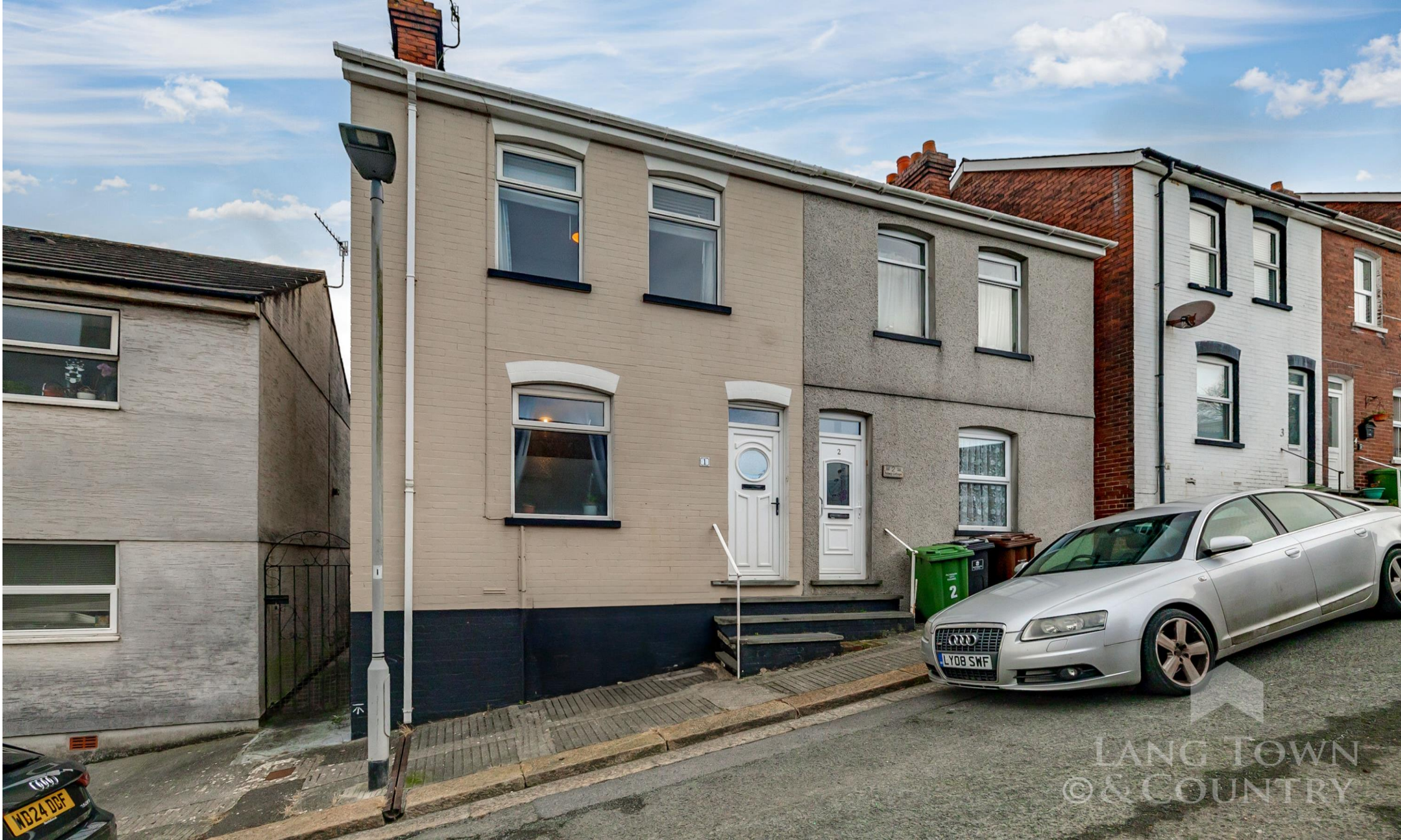
1 Railway Cottages, Ford, Plymouth, Devon, PL2 1LE