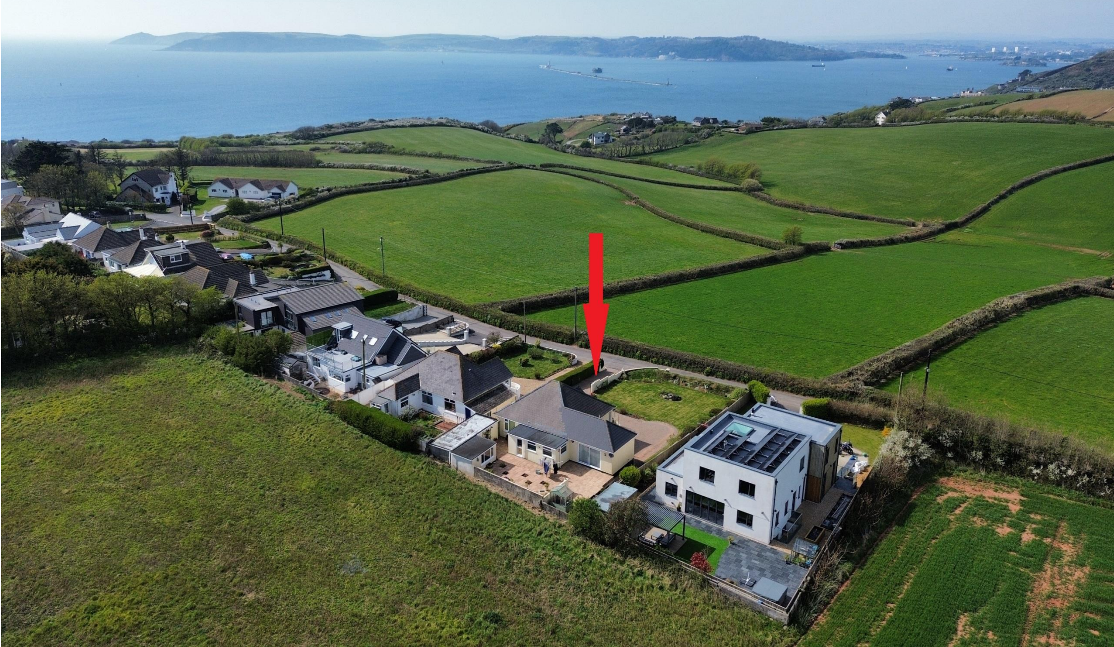
Seasons, Renney Road, Heybrook Bay, Plymouth, PL9 0BD