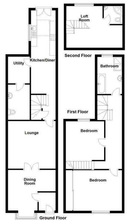
Total area: approx. 124.3 sq. metres (1338.3 sq. feet)