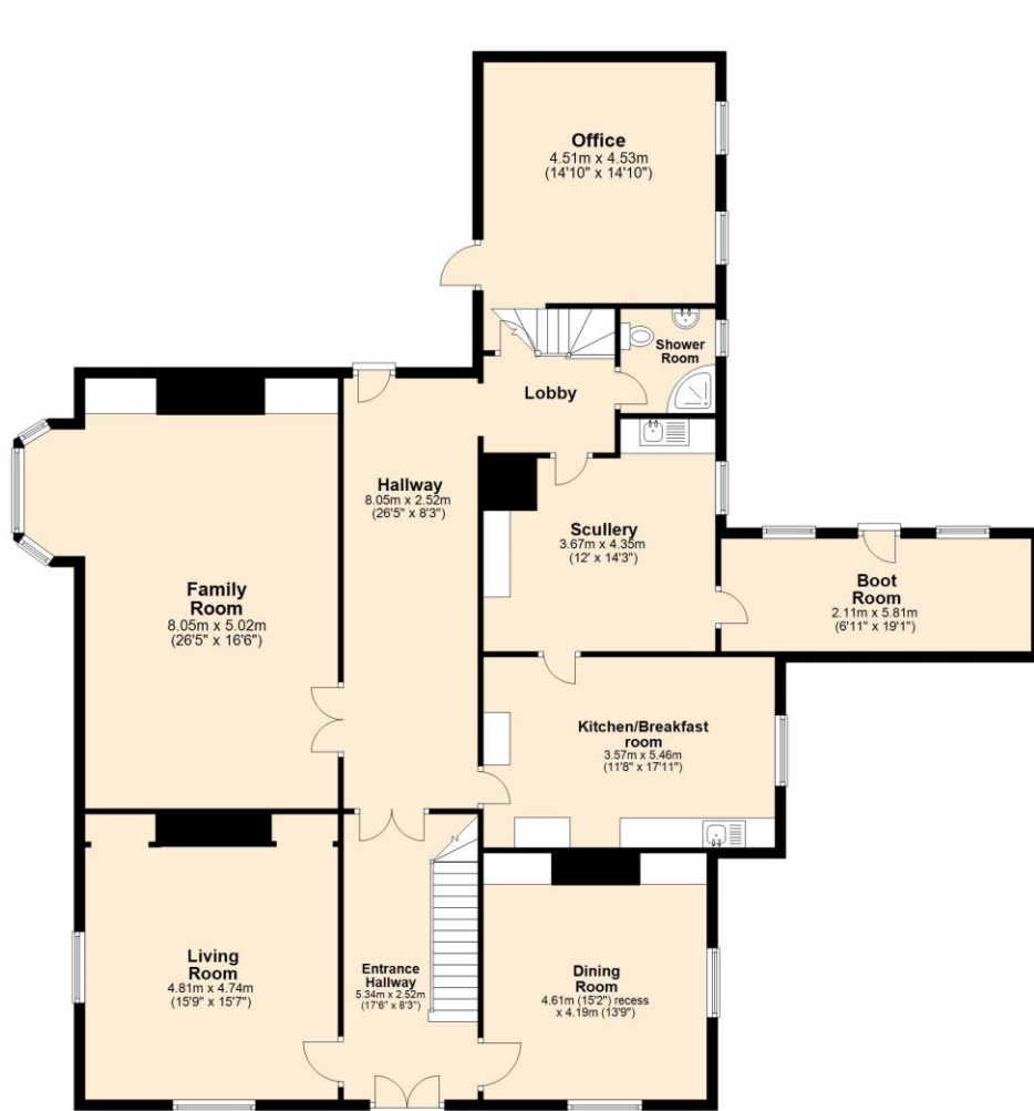
Ground Floor Approx. 204.3 sq. metres (2198.7 sq. feet)