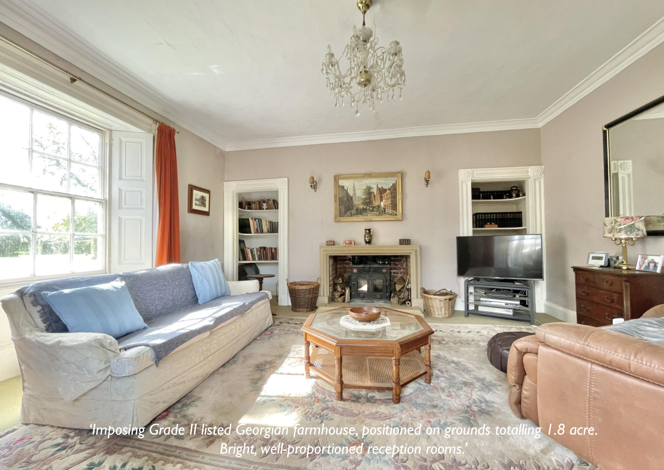
'Imposing Grade II listed Georgian farmhouse, positioned on grounds totalling 1.8 acre. Bright, well-proportioned reception rooms.'