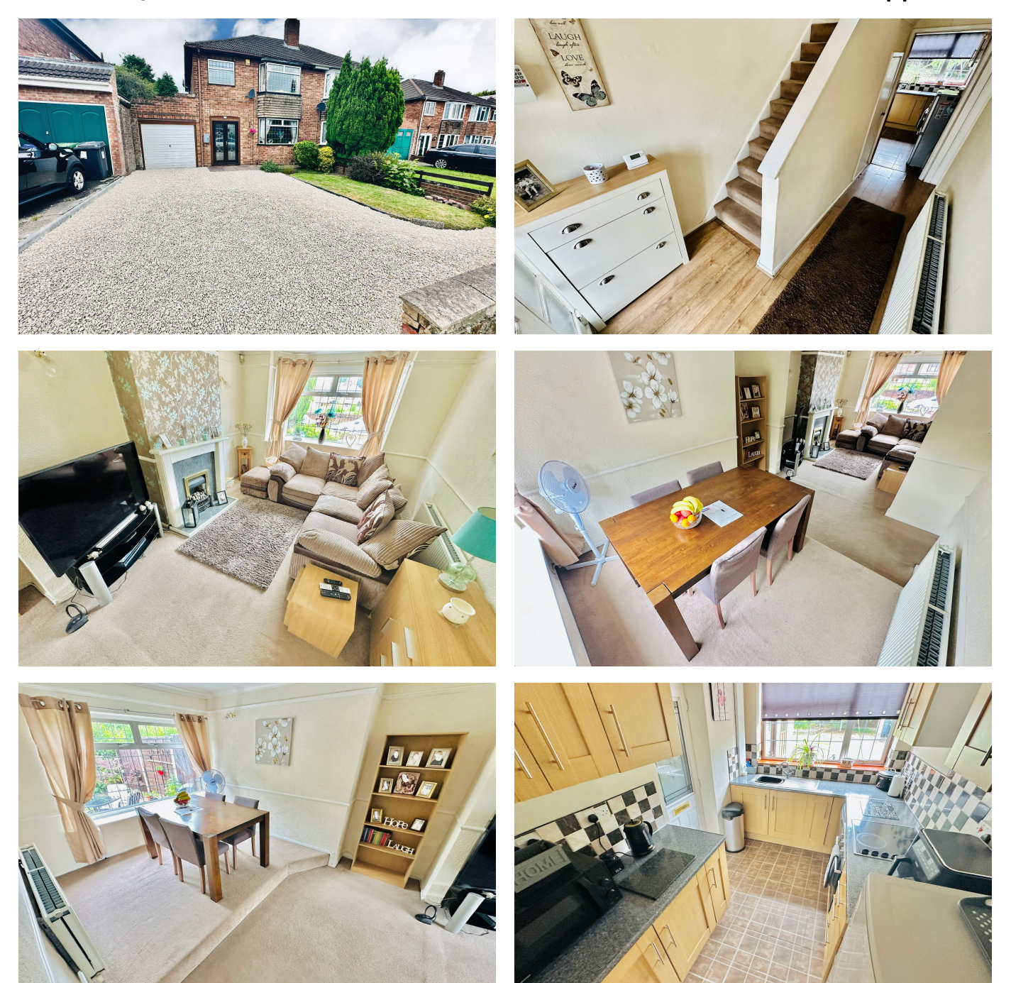
🍋 3 🚰 1 🚘 1

Birmingham New Road, Bilston Offers In Region Of £204,950