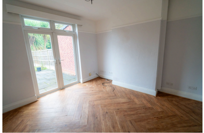
1ST FLOOR 409 sq.ft. (38.0 sq.m.) approx.