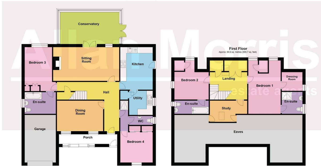
Total area: approx. 221.8 sq. metres (2387.5 sq. feet)

DISCLAIMER - Floor plans shown are for general guidance only. Whilst every attempt has been made to ensure that the floorplan measurements are as accurate as possible, they are for illustrative purposes only.