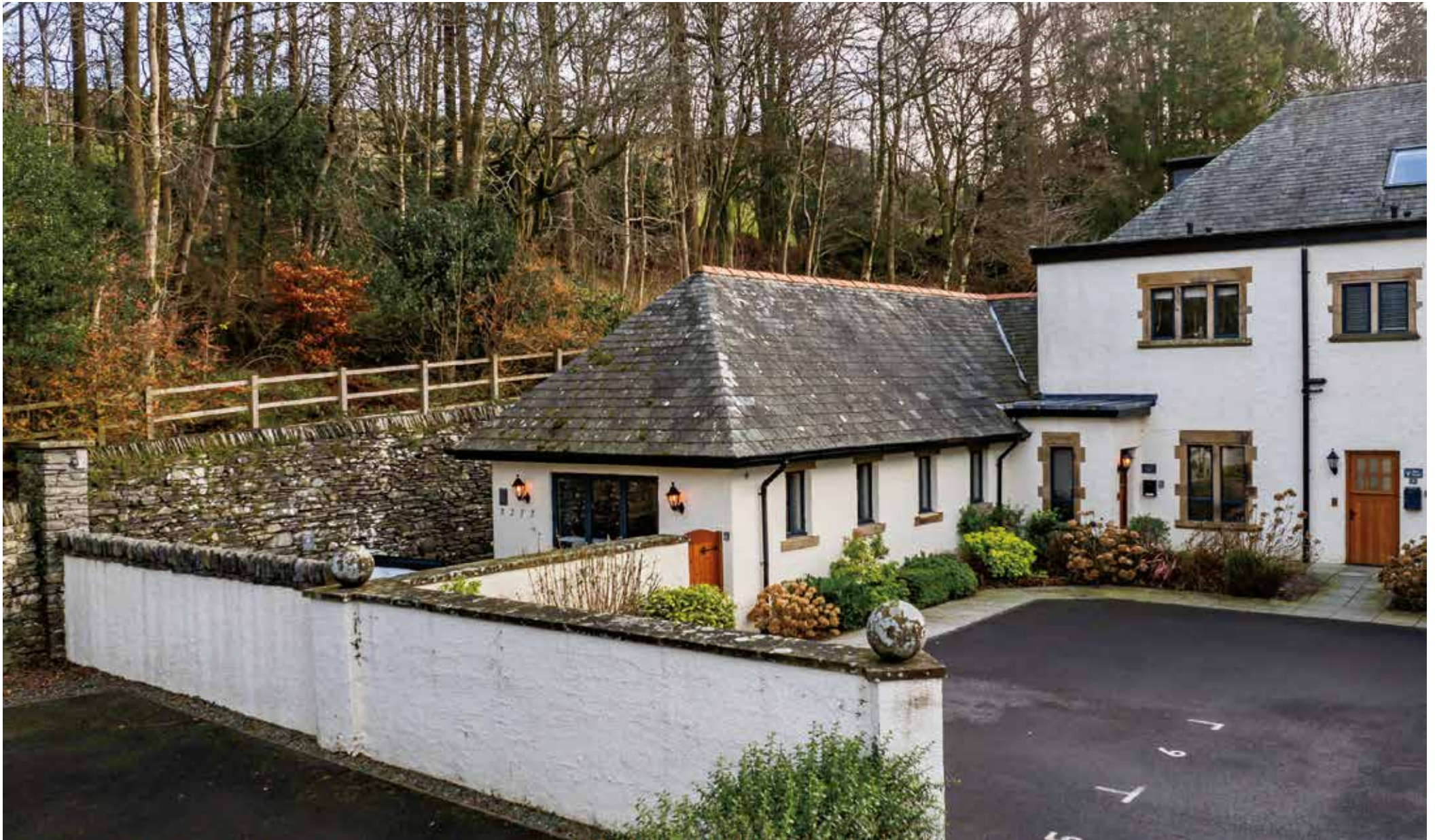
Bam Lodge 6 Applethwaite Hall | Windermere | The Lake District | LA23 1PZ