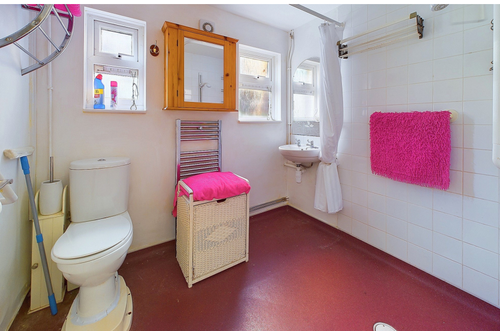
Property details: Cromleigh Way | Southwick | BN42 4WG