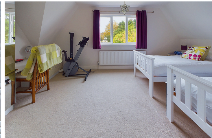
Property details: Hamfield Avenue | Shoreham by Sea | BN43 5TY