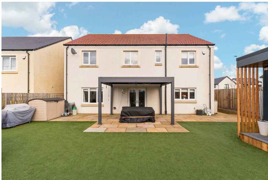
1 Beech Path, Calderwood, East Calder, EH53 0FR