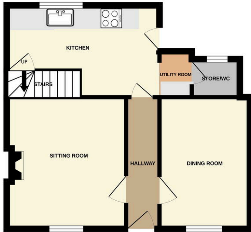
GROUND FLOOR 409 sq.ft. (38.0 sq.m.) approx.