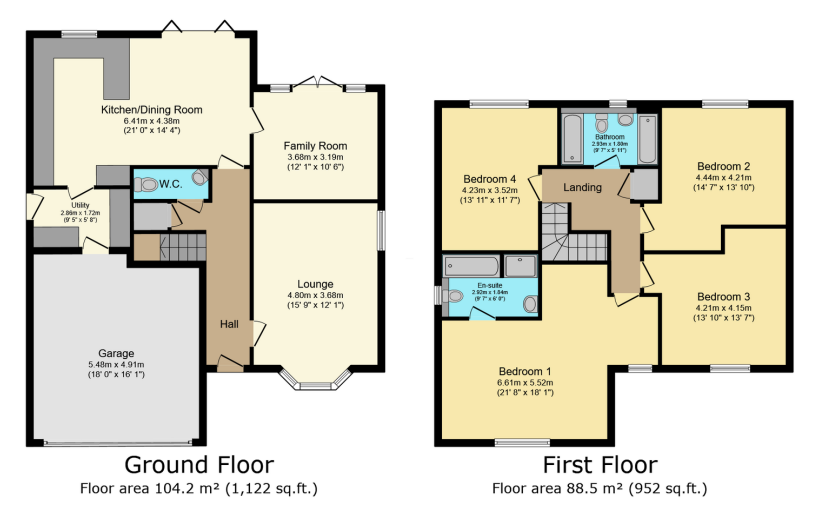
TOTAL: 192.7 m<sup>2</sup> (2,074 sq.ft.)