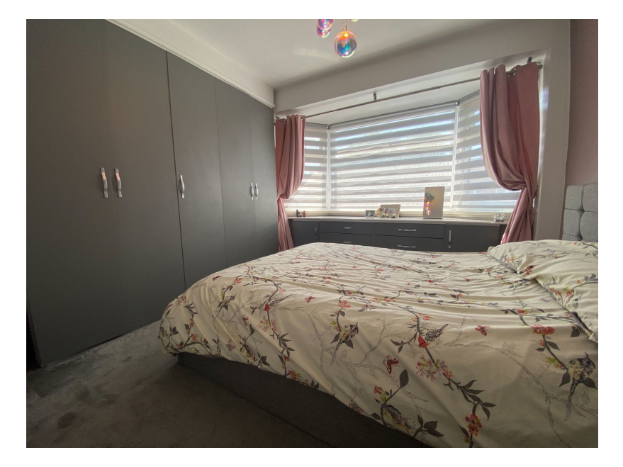
Chadderton Office 509 Middleton Road, Chadderton, Oldham, OL9 9SH