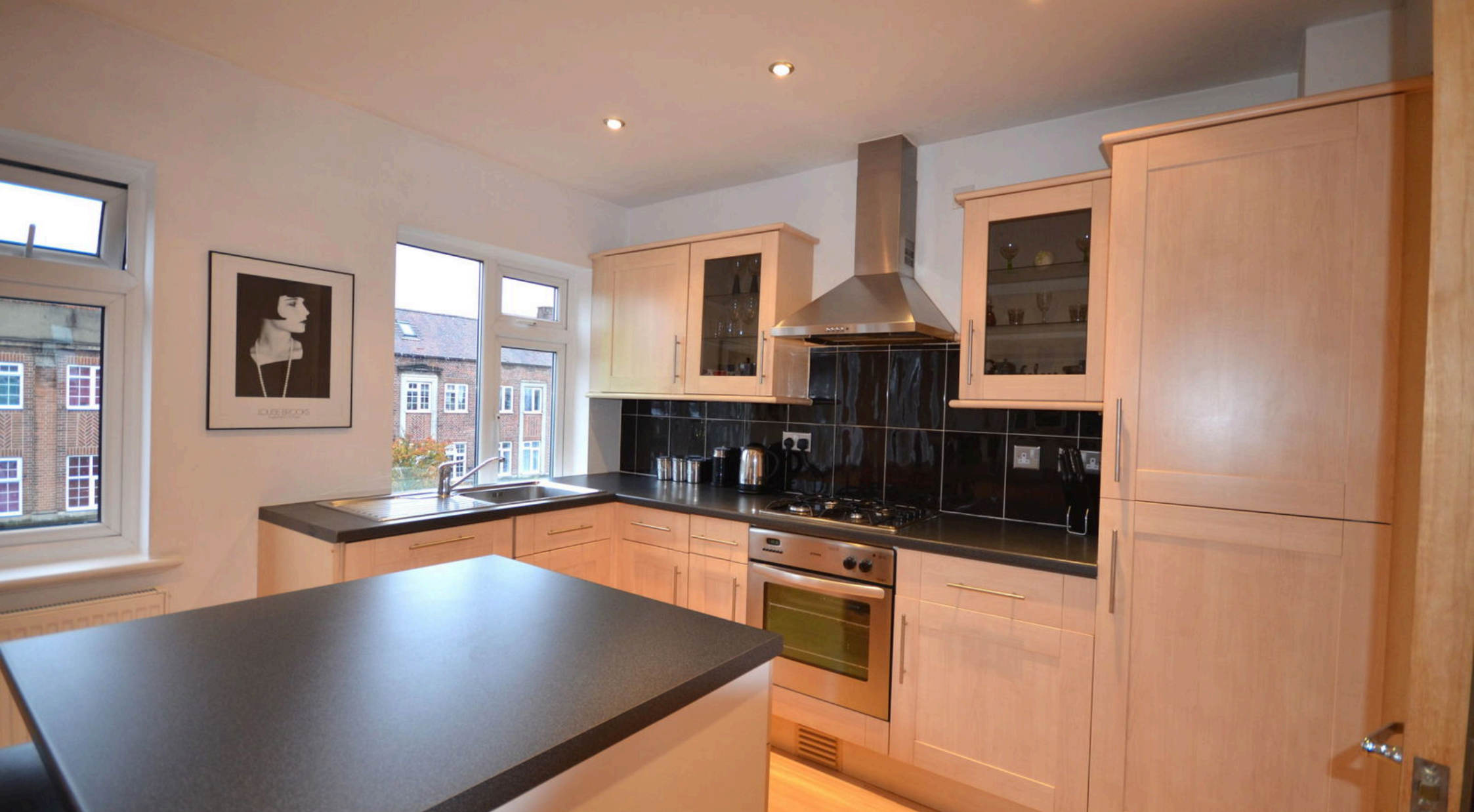
Station Parade, Kenton Lane, Belmont, HA3